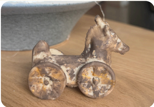
Le cheval à roulettes