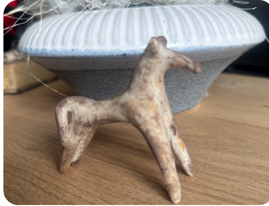
Le petit cheval